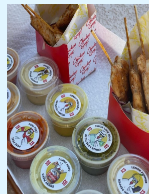
Chicken Tenders with all the sauce -