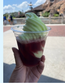
Sangria Float with Lime—Swirls on the Water

The Candy Cauldron - Will have GF rice crispy treats since ingredients have changed and will sometimes have GF candy apples. Always ask.