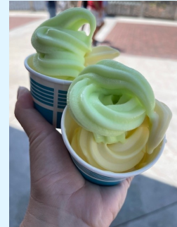
Lime and Lemon Dole Whip—Swirls on the Water