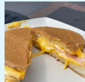
Kids Ham & Cheese ABC Commissary