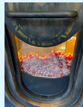
Galaxy's Edge Popcorn