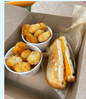
Woody's Lunch Box- Kids grilled "cheese" with potato barrels