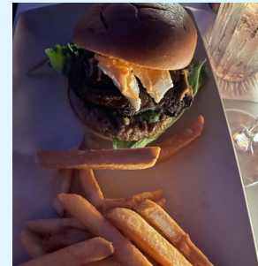
Flying Saucer Burger Sci-Fi Dine-In