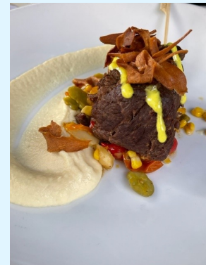
Braised Short Rib - Brown Derby Lounge