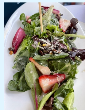
Greens & Strawberry Salad - Brown Derby Lounge