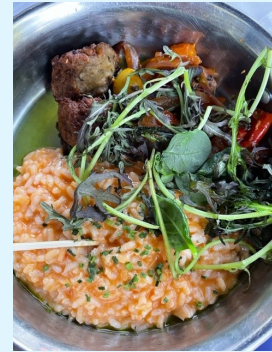
Tomato Risotto - Brown Derby Lounge

Oga's Cantina - Drinks and Lite Bites. Happabore Sampler (ask for GF chips/bread)