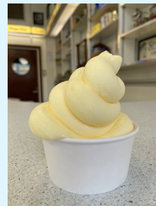
Pineapple Dole Whip – Schwab's Pharmacy (GF/vegan)