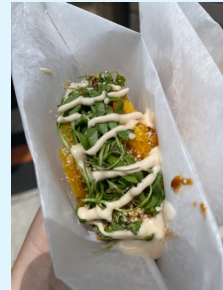
Arepa located at a food stand during each festival

Use this as a guide to help you. It is always recommended to speak with a chef or cast member to verify information as ingredients, vendors, and options may change without notice.