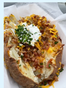
Loaded Jacket Potato - London Taxi Hut