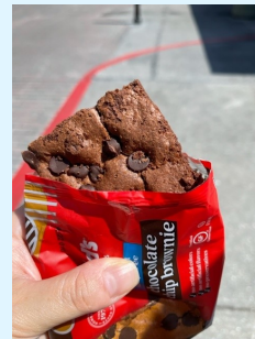
GF/DF brownie located at several stores throughout Universal