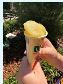
Luigi's Italian Ice - Avenue Eats