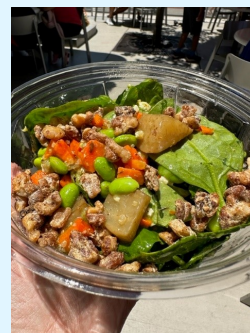
Beet and Carrot Salad - The Today Cafe

Central Park Crepe Cart (near Café LaBamba) - nothing GF available here