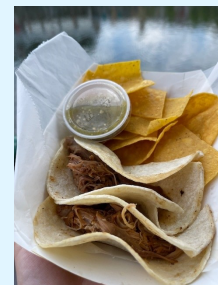
Bumblebee Man's Taco