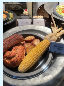
Chicken & Ribs Platter - Three Broomsticks