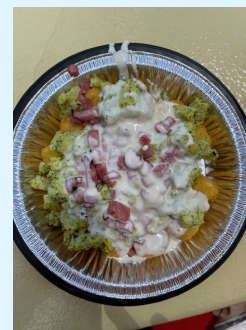
Green Eggs & Ham Tots - Green Eggs & Ham