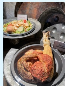
Rotisserie Smoked Chicken - Three Broomsticks

Butterbeer - All butterbeer is GF. Frozen and regular butterbeer is GF. Vegan without the foam topping. Hot Butterbeer contains dairy.