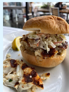
Crab Cake (Sandwich)

GF/vegan items: none noted on the menu. Company response indicated options available upon request for GF/Vegan