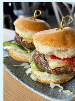
Snake Bite Sliders