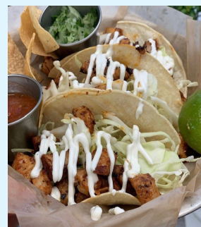
Mahi Mahi Tacos