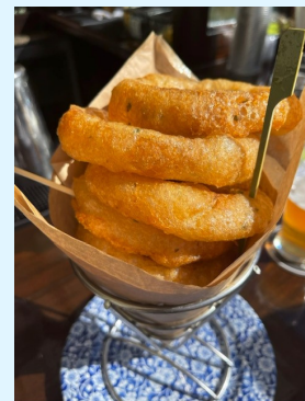
GF/vegan Onion Rings—Raglan Road

Use this as a guide to help you. It is always recommended to speak with a chef or cast member to verify information as ingredients, vendors, and options may change without notice.