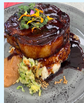
Let There Be No Rush Pork—Raglan Road