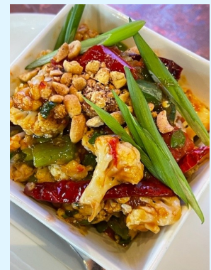
Kung Pao Cauliflower